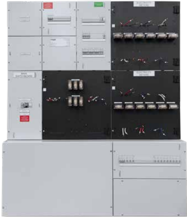
Assembled and wired meter panel and/or distribution devices