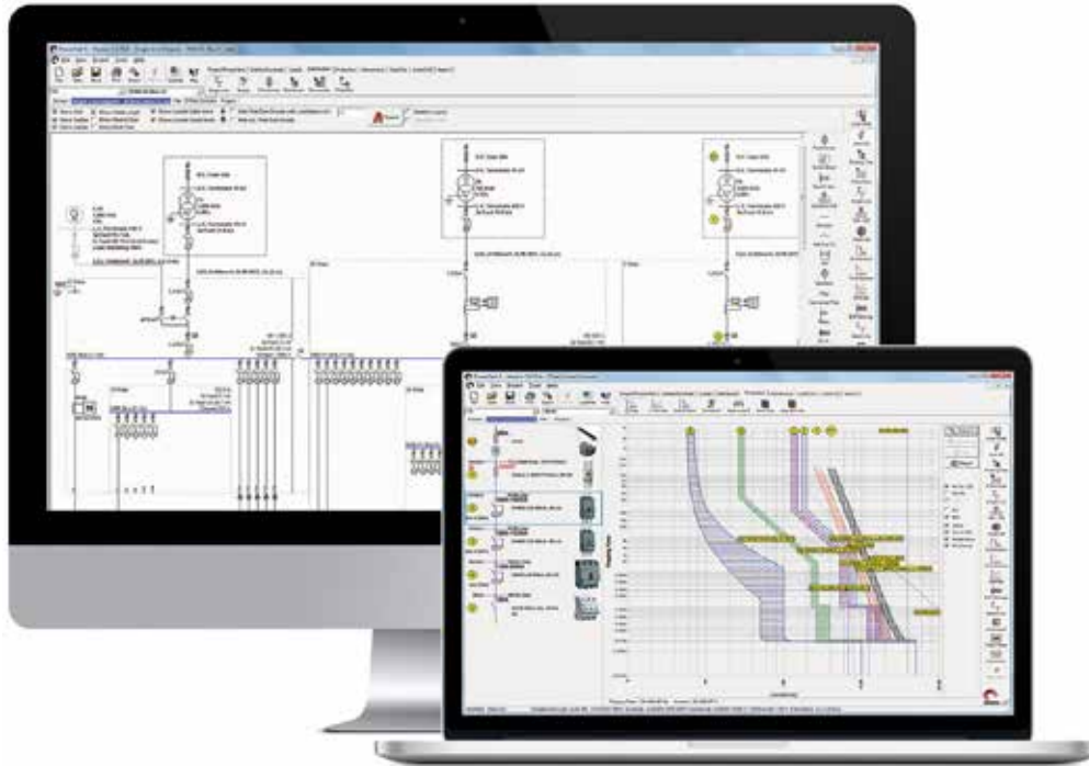
Backed with Powercad industry leading software.