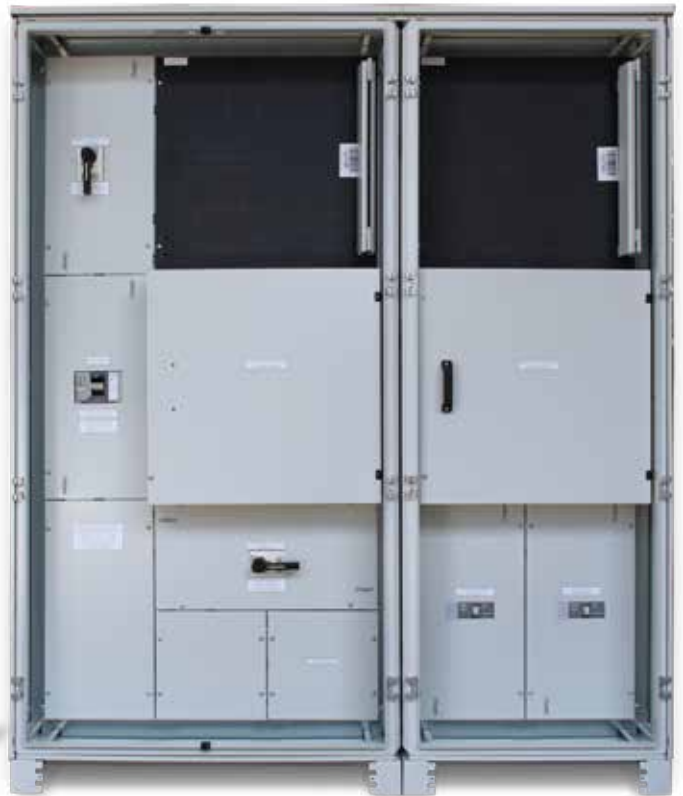
Assembled and unwired meter panel

As the local specialist, we guarantee that the delivered products comply with Australian Standards, State based service installation and local utility metering requirements; and more importantly we deliver an optimised configuration for your building needs.